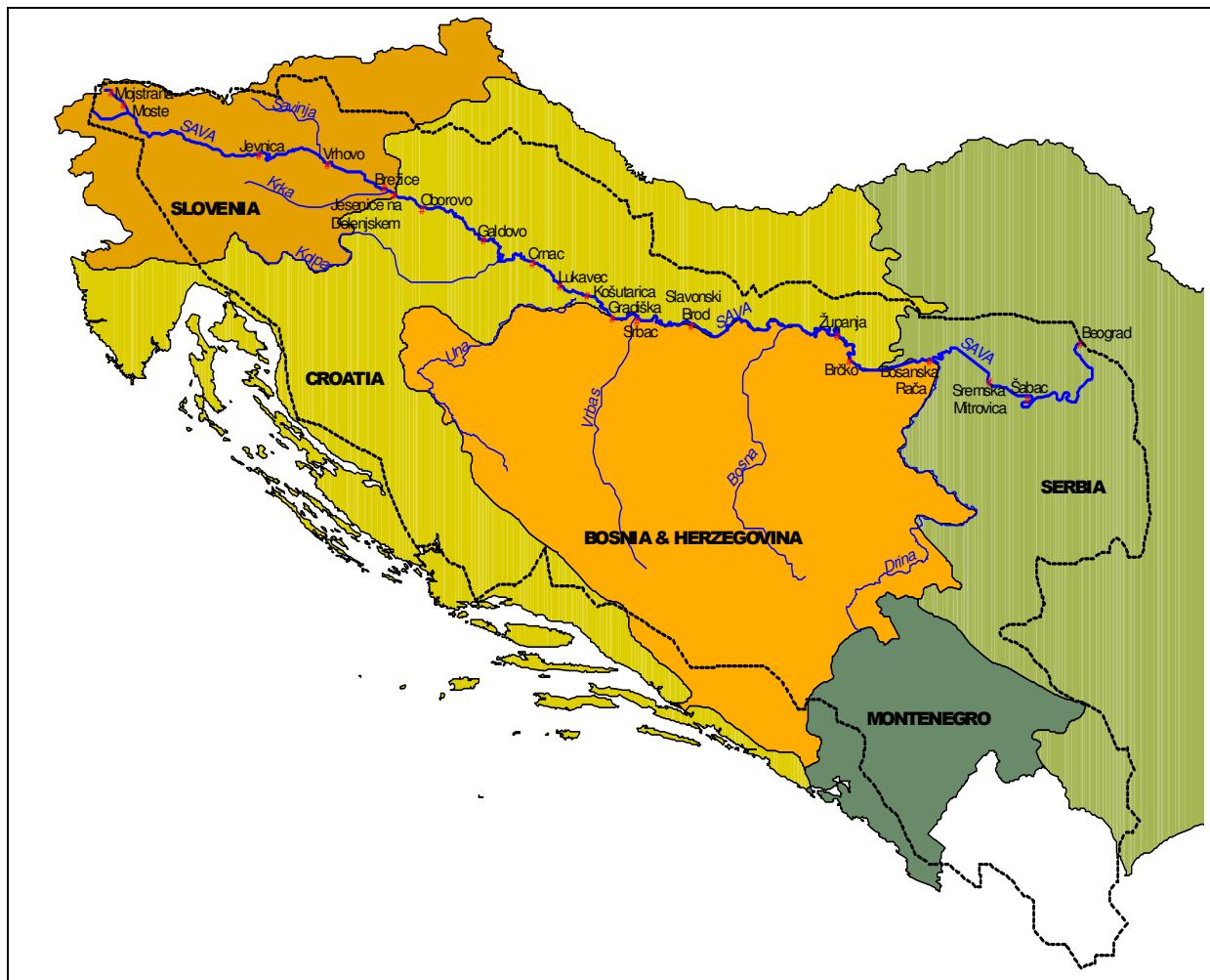
Fig. 1 Sediment sampling sites along the Sava River